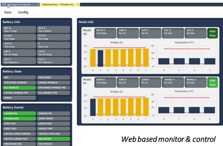
Web based monitor & control